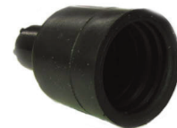
Distributor and Coil Wire Nipple