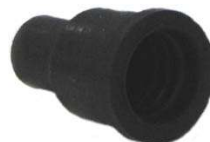
Ignition Coil Wire Nipple fits all oil filled coils