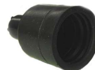
Distributor and Coil Wire Nipple