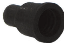
Ignition Coil Wire Nipple fits all oil filled coils