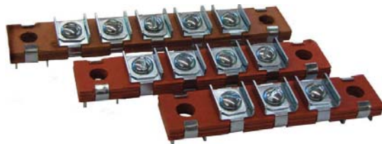
GM style headlight junction boards